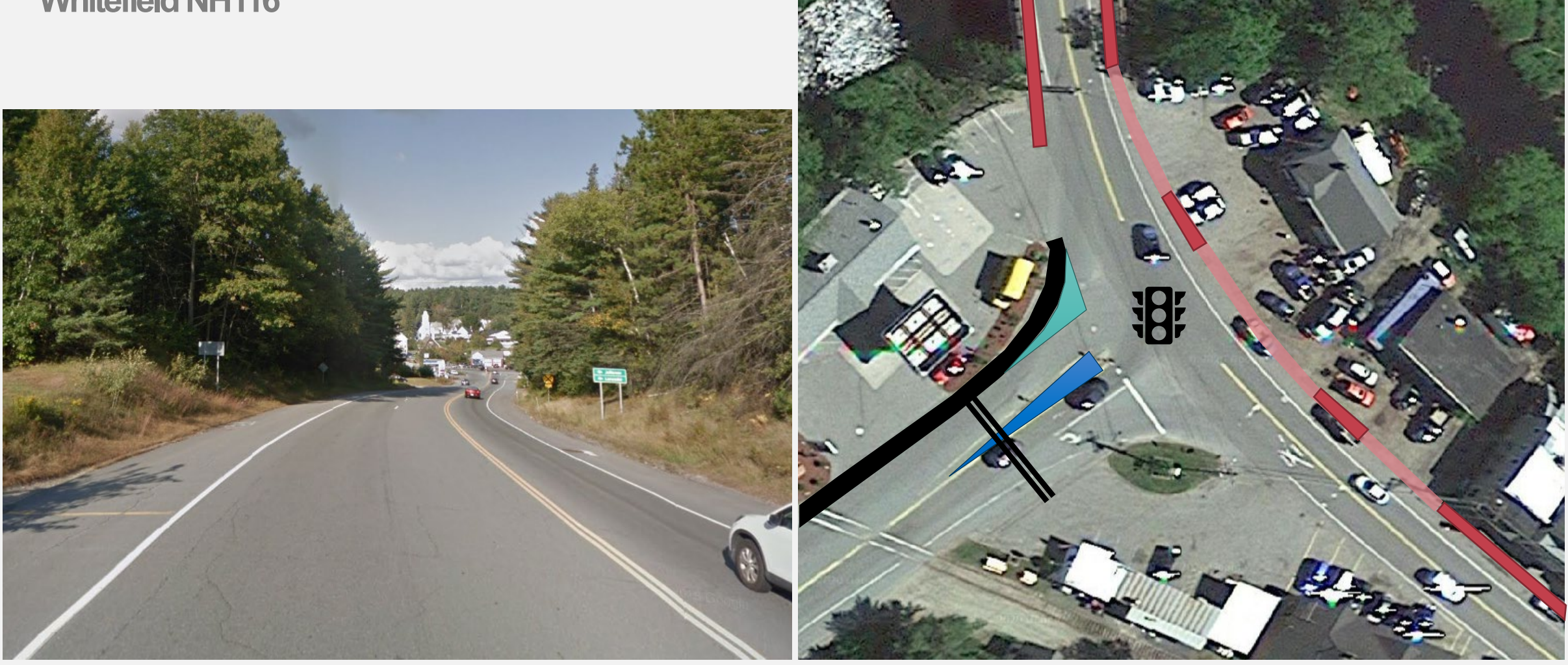
DISCLAIMER: for conceptual planning purposes only