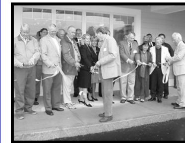
On May 27, 2009 the Littleton Food Co-op hosted a ribbon-cutting ceremony to mark its

official opening. Food vendors, including local producers from Whitefield and Bethlehem, offered sample tastings. The Co-op opened with over 3,000 members, far exceeding their expectations, although they are quick to point out that non-members are welcome to shop there as well. The Co-op is located on Rt. 302, at the corner of Cottage Street in