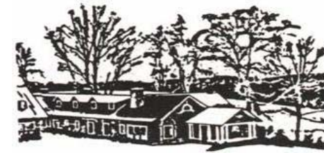
North Country Council Regional Planning Commission